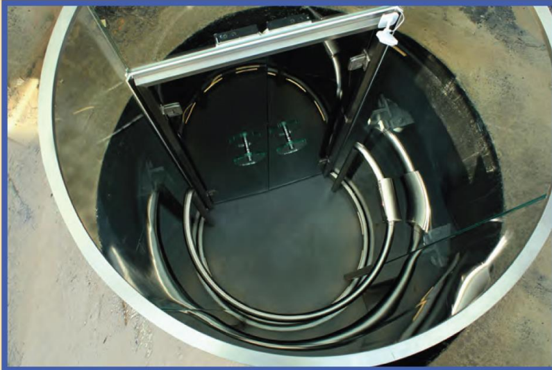
Fully glass cabin (view from above)