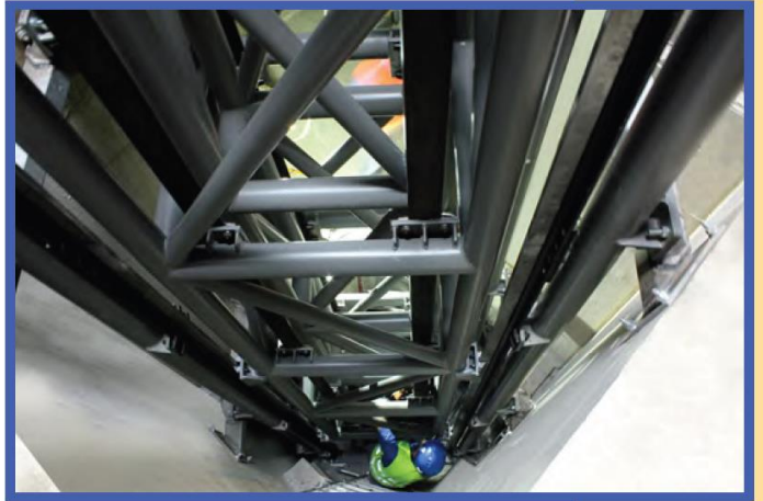
Drive system onsite (assembling location)