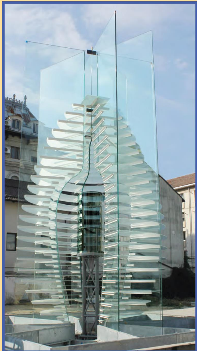
The hydraulic platform (outside view)

Unique hydraulic device allows a passenger to experience an immersion into renowned sculptor’s world.