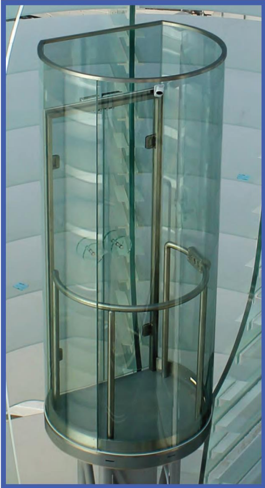
The panoramic cabin