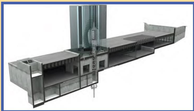
A 3D model of the Brâncuși International Art Center

The architectural spirit of the Constantin Brâncuși International Art Center is built on the work of its namesake, the great Romanian sculptor Constantin Brâncuși. Brâncuși (1876-1957) made major contributions to the renewal of the Romanian language and artistic vision through his work. More than a central figure in the modern artistic movement, Brâncuși is considered one of the greatest sculptors of the 20th century. It is with this spirit and vision that the Art Center commissioned the “Pasărea Măiastră” (Bird in the Air) passenger platform lift. Within the boundaries of the Art Center in Craiova, an underground wing was built and dedicated to Brâncuși, who, though born in the village of Hobița, received his professional training in Craiova as a teenager. The underground wing is topped by a gazebo of glass, a work part architecture, part “optical-art” sculpture that aims to create an optical illusion between several forms often found in Brâncuși’s work: square cube-prisms, ovoid form and fusiform volume. At the same time, there is a reference to a project Brâncuși did not carry out: the Temple of Indore. The “Glass Gazebo” inside the Art Center arose from the legend of his uncompleted project, being