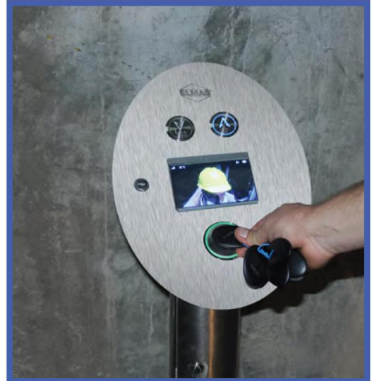
The landing operating panel is activated by card.