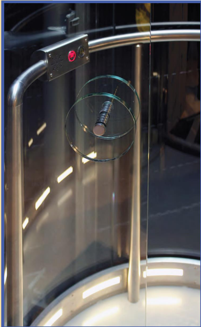
Cabin control panel/handrail

realized of integral glass walls 12 m high and 3 m wide, constituting a prismatic square volume on the outside, while, on the inside, horizontal glass lamellae and an ovoid “being” suggested inside: a silhouette of the “Bird in the Air.”