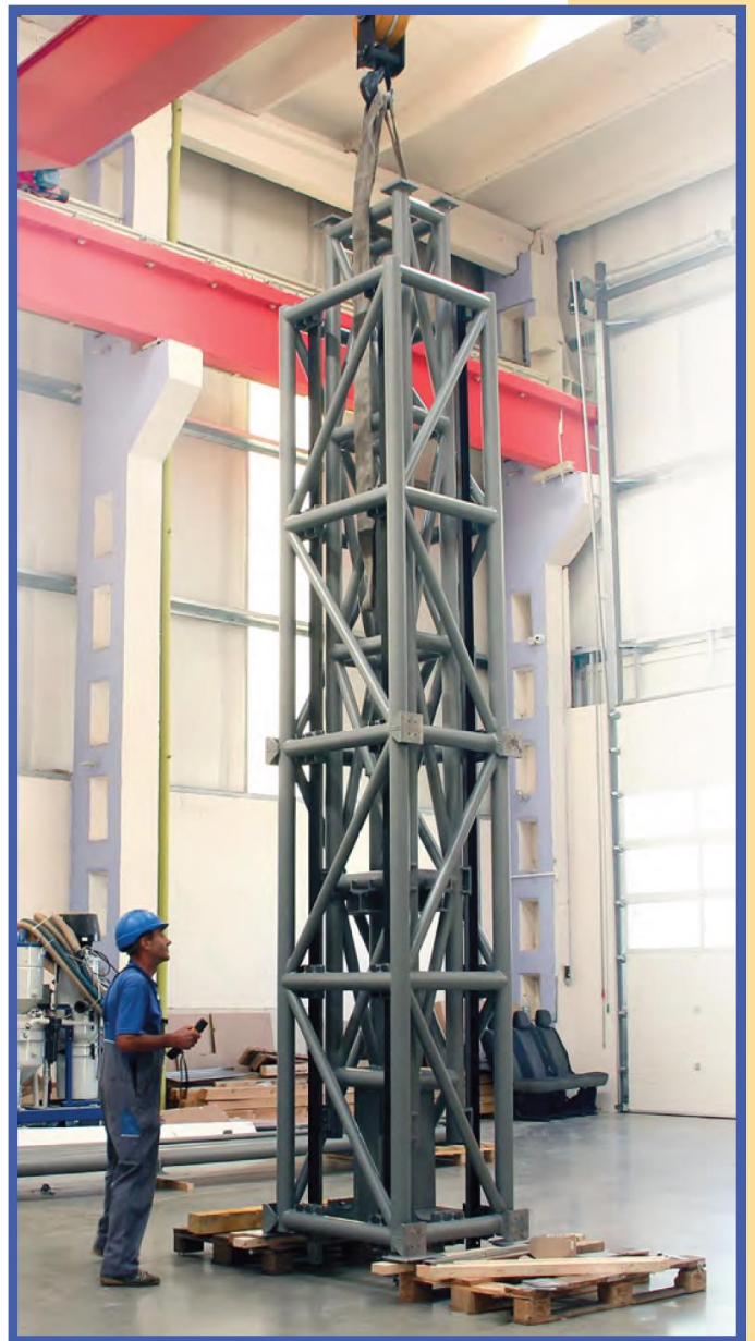
Drive system pre-assembling phase