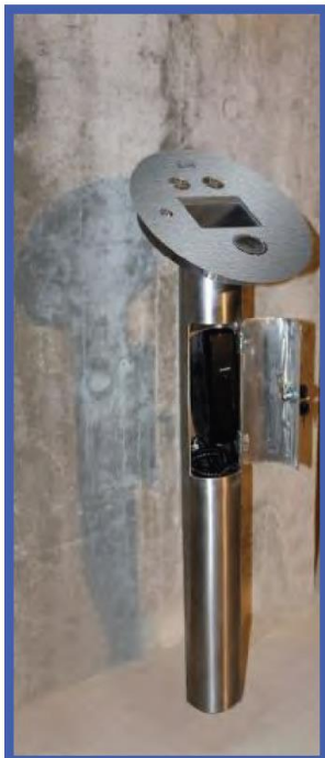
Communication system (intercom type)